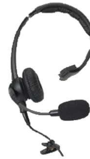
RCH51 Rugged Wired Headset