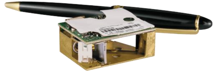
SE965 1D Standard Range Scan Engine

SE4750 1D/2D Standard Range Array Imager