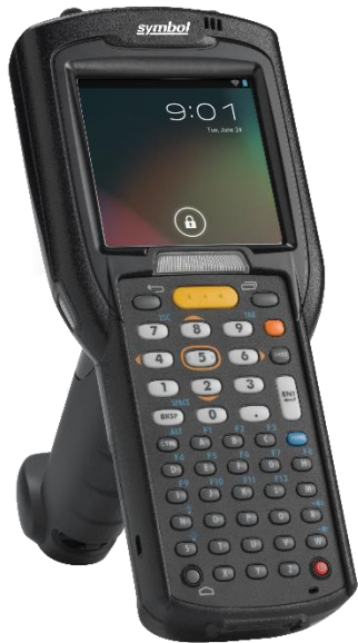
Android 4.1 Jelly Bean